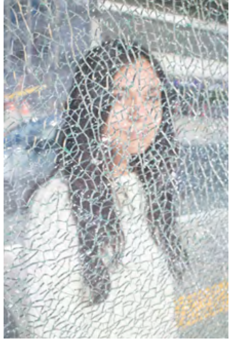
Percevault Special citation 2019 edition

Honouring his memory every year, the school announces these scholarships to promote the study of photography and to facilitate the development of young photographers.